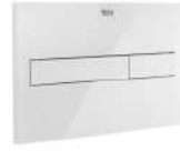
PL7 (DUPLO ONE) - Dual flush operating plate for concealed cistern (Glass finish)