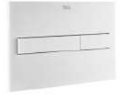
PL7 (DUPLO ONE) - Dual flush operating plate for concealed cistern (Matt finish)