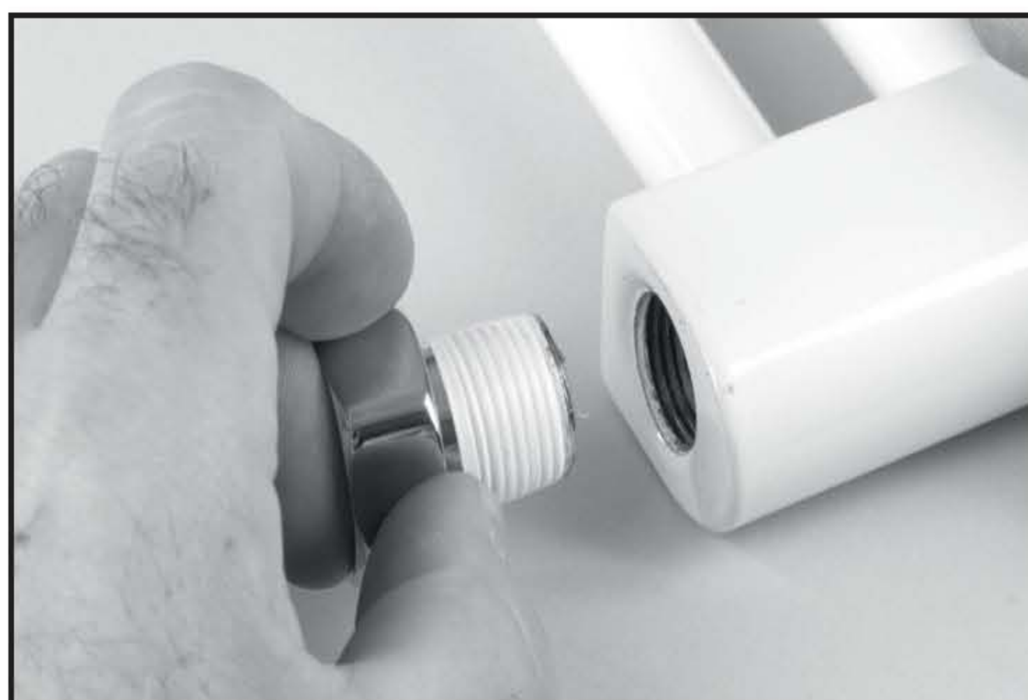
2. Screw the threaded end into the radiator or towel rail