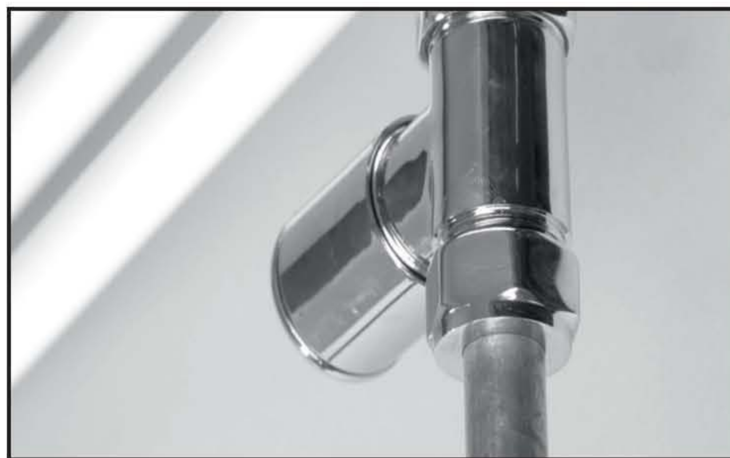
8. Run the central heating to the radiator