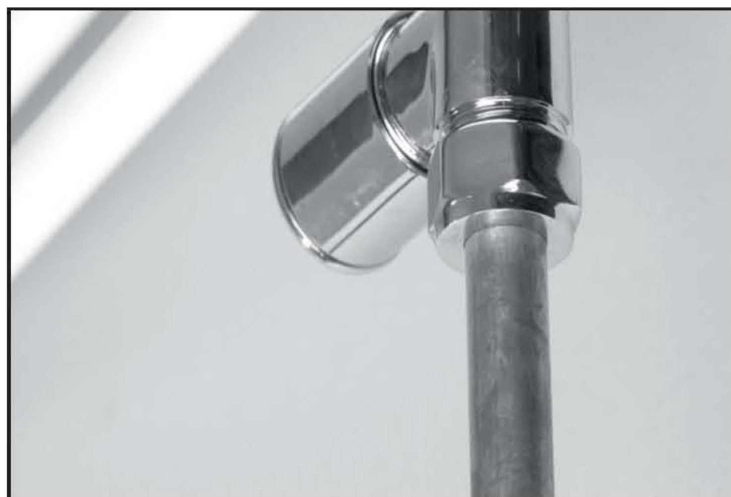
6. Insert pipe.