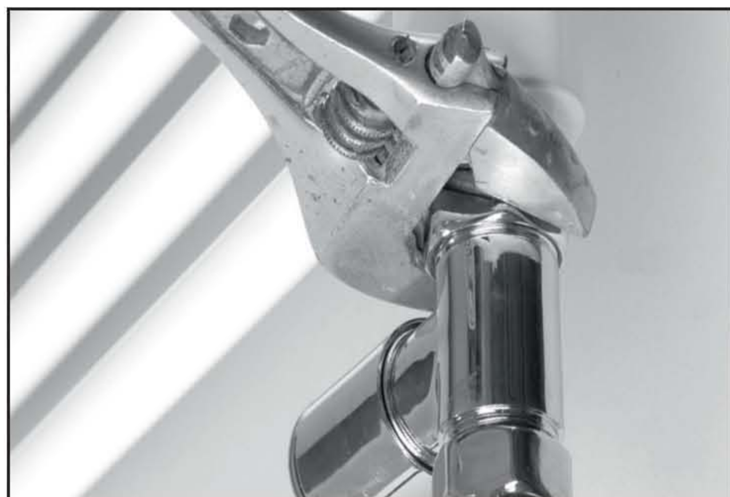
5. Fully tighten the valve using an appropriate tool