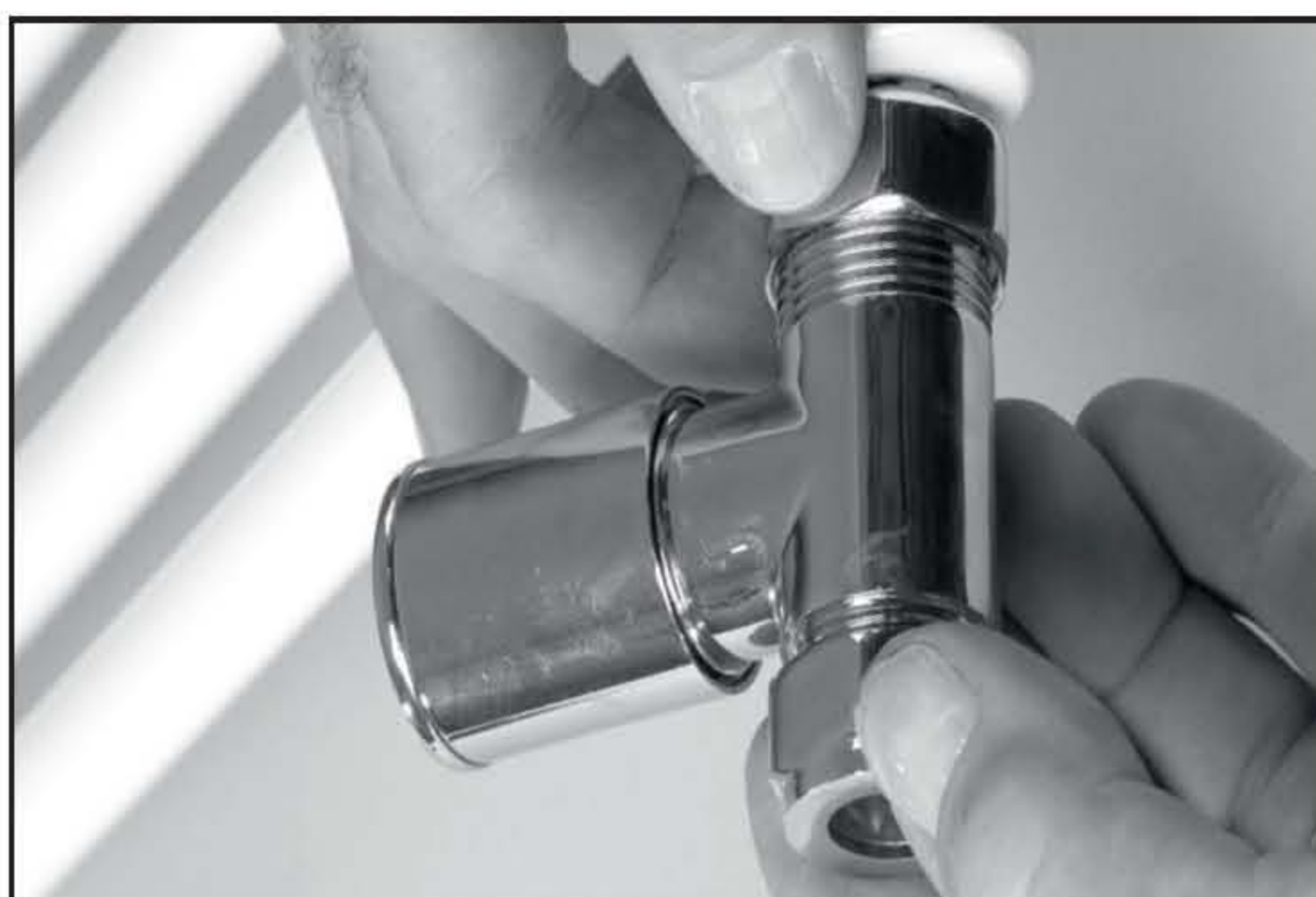
4. Attach valve and turn finger tight in to the correct position