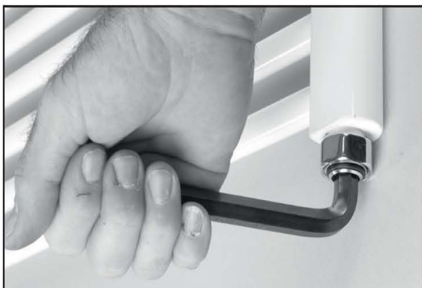
3. Tighten using an appropriate tool