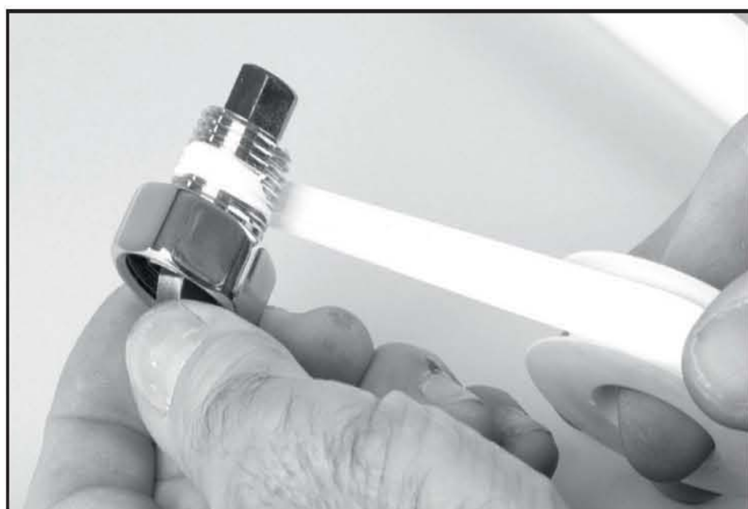
1. Wrap PTFE tape clockwise around the tail thread