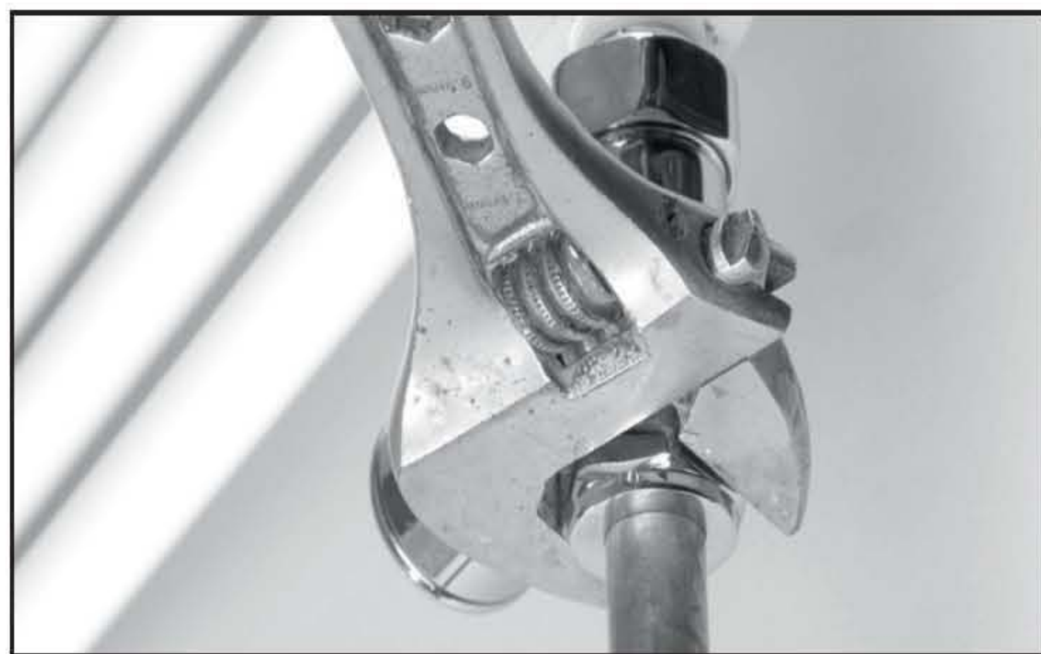
7. Tighten the the nut that holds the pipe in position