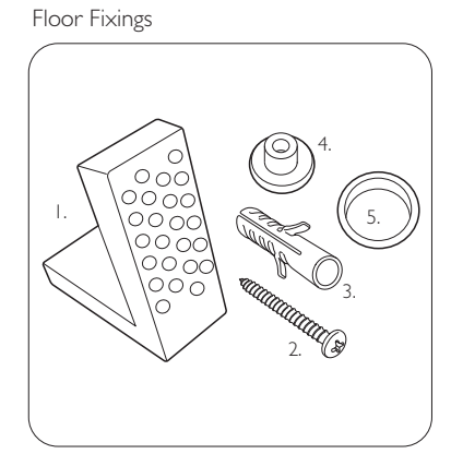
- 1. 2x Nylon Floor Bracket