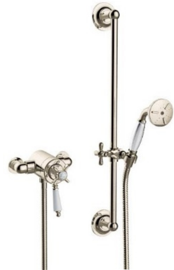
Vintage Gold Pictured